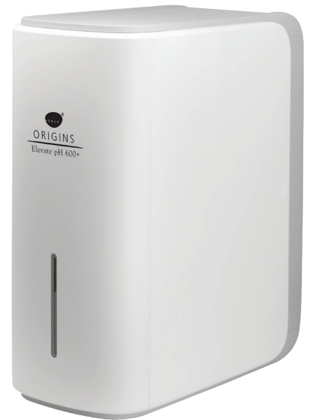
Includes dedicated 3.2 gallon tank and all hardware. Faucet sold separately.