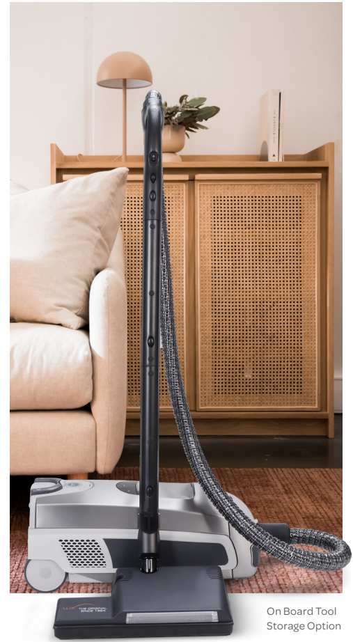
On Board Tool Storage Option

If an object becomes tangled in the power nozzle brush, the circuit breaker will automatically shut off the brush to prevent damage. A built in thermo coupler protects the motor by shutting it down if it overheats.